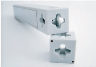
Standard Beam Lengths Centre to Centre, (C/C)

This makes t3Xtra the most versatile display system available anywhere.